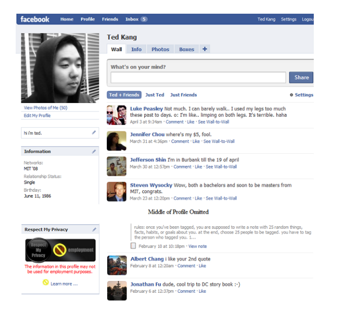
Figure 5: A user's Facebook profile with the RMP icon in the lower left. Any Facebook user who clicks on that icon is directed to a page, which offers additional information on the applied restrictions.

the profile page so that everyone who visits a user's profile page can clearly see the restrictions that the user has placed on his personal information.